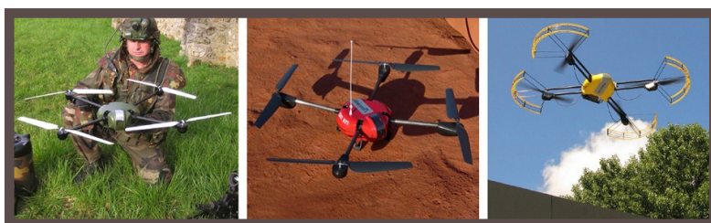
From left to right: the U130, the NX 110 and the NX 110m

Drones can be used in every market in fact, whether it's military, civil or commercial. For example, the construction industry intends using them for inspecting structures and the civil defense and fire departments for search and rescue or damage appraisal following natural disasters.