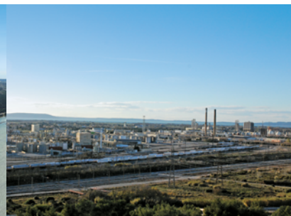
Industrial cluster in Berre