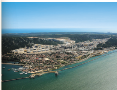
La Mède