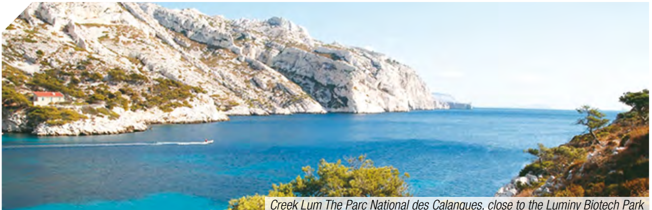
Creek Lum The Parc National des Calanques, close to the Luminy Biotech Park

Business leaders and entrepreneurs come from all over the world for the quality of life and the competitive costs.