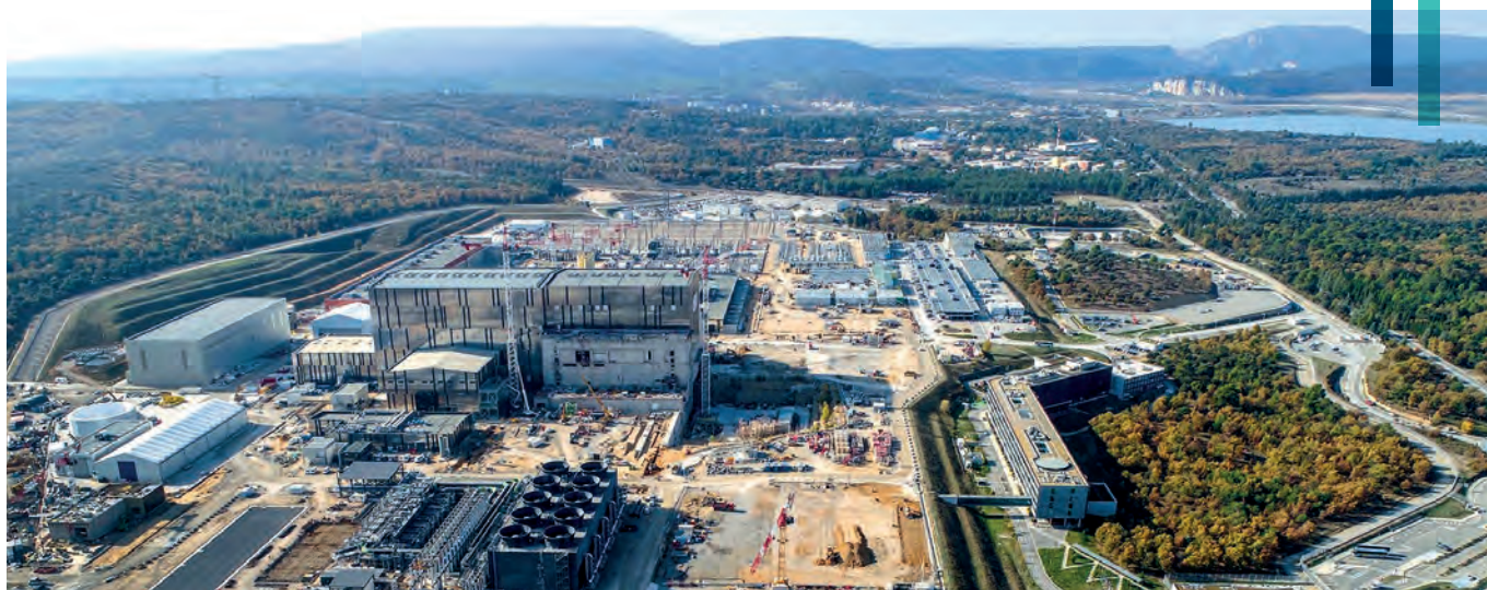
Provence is home to the world's biggest scientific project with 35 countries cooperating on the €20-billion ITER experiment to prove the viability of unlimited green fusion energy.

Provence and India enjoy a long history of trade, friendship, and exchange. Cooperation dates to the 17th century when Marseille was the European gateway for the Indian textile industry and today it is as vibrant as ever with initiatives such as the 2021 talks between Provence Promotion, the Marseille-based Africalink network, and Indian business leaders to develop Africa-India projects. The privileged India-Provence relationship offers enormous advantages and diverse opportunities to Indian entrepreneurs seeking to invest in the Provence area.