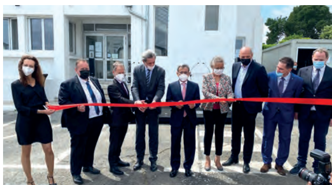
The Indian Ambassador in France during the inauguration of the Indian group expansion in Arles, Electrosteel's expansion in Arles. The production and logistics facilities are benefitting from the proximity to the Port of Marseille Fos and its exposure to Africa.

India is a key member of ITER and Indian industrial giants like Larsen & Toubro are providing essential manufacturing support.