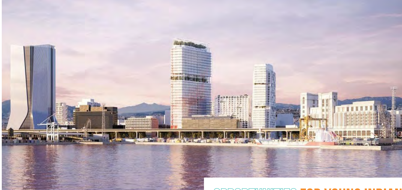
Euroméditerranée, the business district of Marseille.