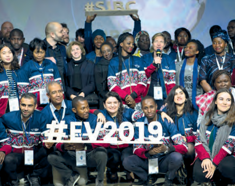
Emerging Valley 2019, a hub for innovations and collaborations between Europe and Africa. It takes place in Aix-en-Provence.