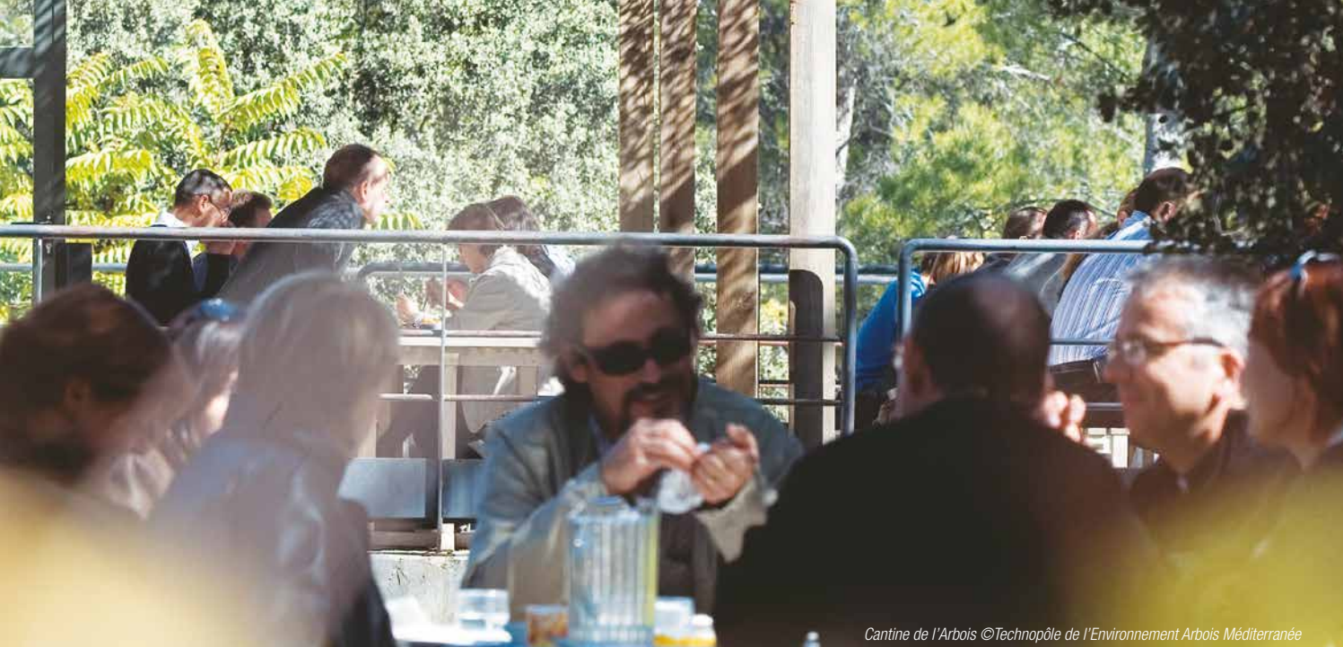
Cantine de l'Arbois